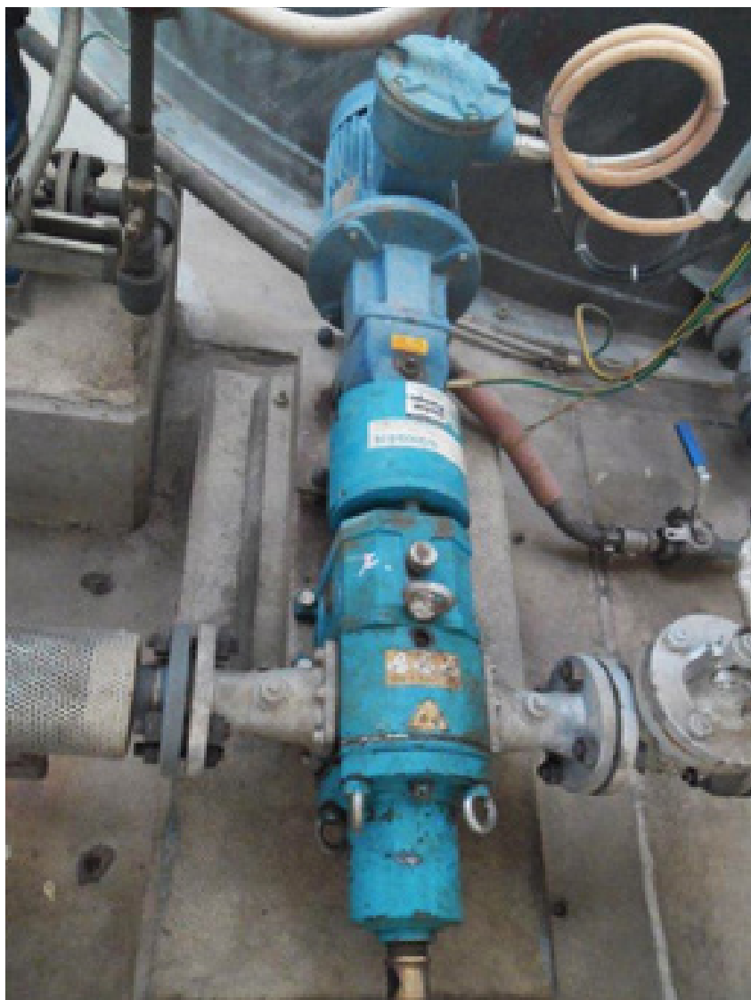
Pictured above: Boerger Lobe pump supplied by Global Pumps at Transpacific's Moomba plant.

They refurbish their pumps every year and a half, and it's a full body refurbishment.