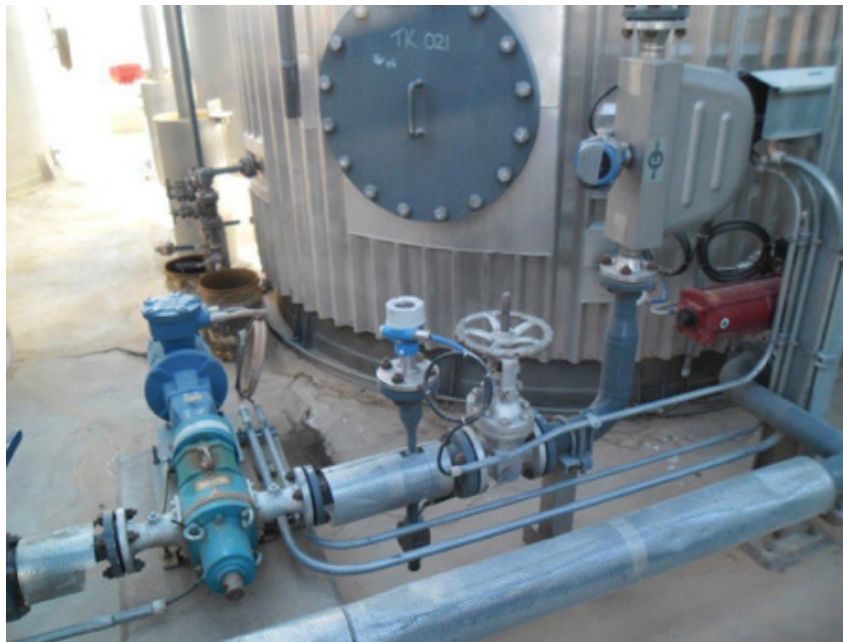
Pictured above: Boerger Lobe pump supplied by Global Pumps at Transpacific's Moomba plant.

Global Pumps have a good range. Their response to enquiries or pricing is always quick. Plus, their service has always been great.