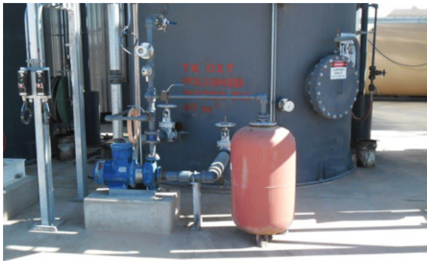
Pictured above: Gould pump supplied by Global Pumps at Transpacific's Moomba Branch.

TRANSPACIFIC INDUSTRIES PRIDE THEMSELVES ON BEING “YOUR TOTAL WASTE MANAGEMENT, RECYCLING AND INDUSTRIAL SERVICES SOLUTION”.